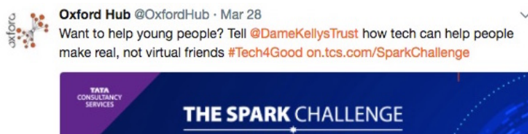
Example: Spring 2017 Twitter advert.

All packages include social media promotion during the week(s) in which your advert runs. Our social media channels have more than 34,000 followers and wider reach.